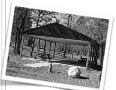
Little Elbow Lake Shelter