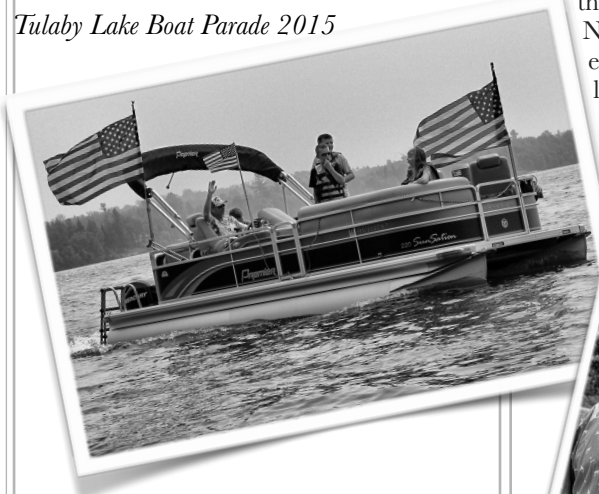
Tulaby Lake Boat Parade 2015

anxious to see the loons return to Tulaby Lake and enjoy their calls and all that nature brings to us in this beautiful corner of Becker and Mahnomen counties. Spring also gives us a chance to welcome back neighbors that have either returned to their primary residence or gone to warmer climates, and enjoy their company once again.