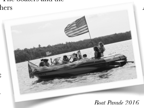
Boat Parade 2016

Last year the lake hosted one of the longest 4th of July Boat Parades ever!! The boat parade traveled around the lake in the opposite direction from other years. The boaters and the parade watchers reported it was a better route! We plan on doing it again in 2017. Meet near the outlet area at 10AM.