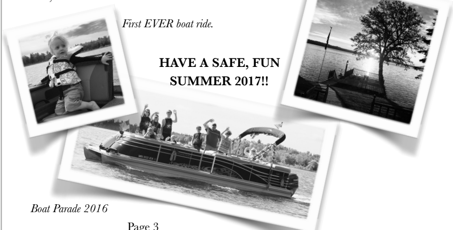
First EVER boat ride.