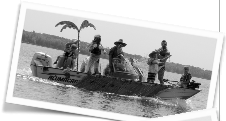
Boat Parade 2018

Kind Regards, Tulaby Lake Association Board