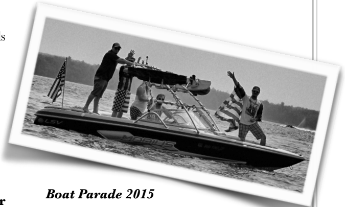
Boat Parade 2015 Throwback

Kind Regards, Tulaby Lake Association Board