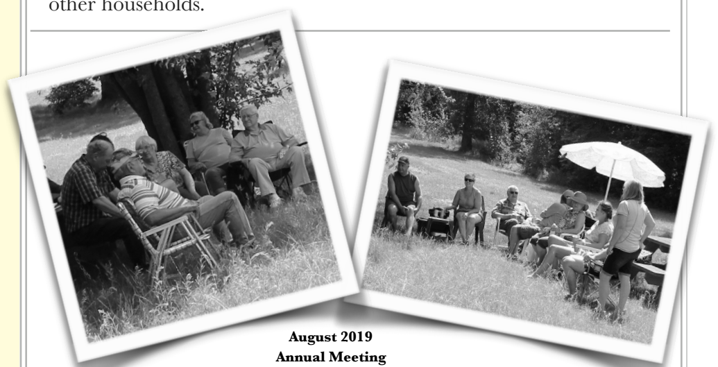
August 2019 Annual Meeting

Under Executive Order 20-38 bait stores, golf courses, and resorts to be open. Minnesota State parks are open for day use only until May 18th. Individuals may engage in outdoor activities (e.g., walking, hiking, running, biking, driving for pleasure, hunting, or fishing), and may go to available public parks and other public recreation lands, consistent with remaining at least six feet apart from individuals from other households.