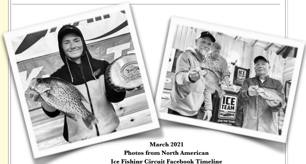
March 2021 Photos from North American Ice Fishing Circuit Facebook Timeline