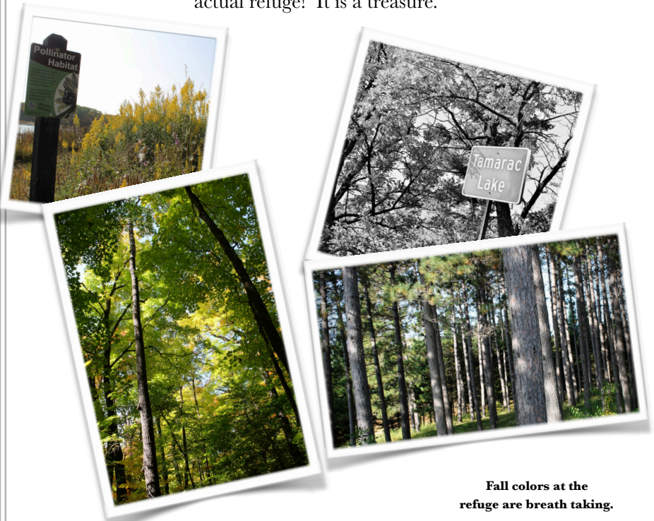
Fall colors at the refuge are breath taking.

Consider a day trip to the nearby Tamarac National Wildlife Refuge, which is south of Tulaby Lake about 40 minutes. The 43,000-acre refuge offers access to over 250 species of birds and a variety of wildlife. The wildlife drive and visitor center area offer spectacular vistas of marshes, trees, and wildlife. There are activities available for children left for access even if the visitor center is closed. Plan to enjoy the many miles of hiking trails and historical sites. The 2.4 mile Old Indian Hiking Trail follows the footsteps of the Ojibwe people. A portion of the North Country National Scenic Trail crosses through the refuge. A landing on Tamarac Lake provides a great place to launch a boat, canoe or kayak. It is also a great place for picnic. Visit the Tamarac National Wildlife Refuge website and then go visit the actual refuge! It is a treasure.