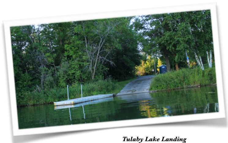
Tulaby Lake Landing

You can visit the association website at www.tulabylakeassociation.org .