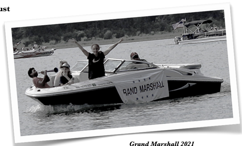
Grand Marshall 2021