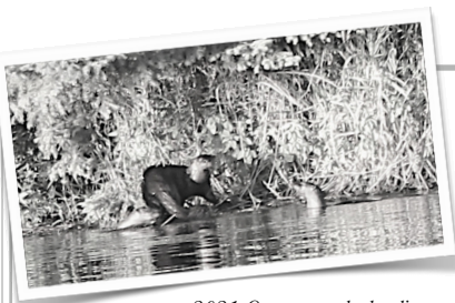
2021 Otters near the landing on Tulaby Lake.