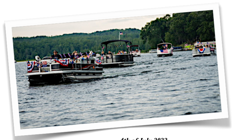
4th of July 2022

Don't forget to like us on Facebook! Your participation with our Facebook page is greatly appreciated.