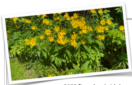
2022 Jerusalem Artichokes Tulaby Lake