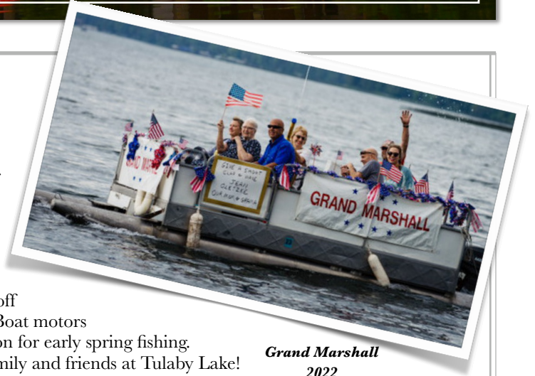
Grand Marshall 2022

And...now, it seems that the winter of 2022-2023 is lingering much longer than we planned. Good thing we are hardy individuals and know that this will pass. The ice will go out and we will get be back into our cabins opening the windows, dusting off the cobwebs, turning on the water and then putting in the dock. Boat motors will be tuned and fishing tackle inventory checked all in preparation for early spring fishing. Soon we will be greeting our neighbors and enjoying days with family and friends at Tulaby Lake!